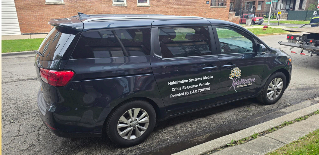
This 2016 Kia Sedan, donated by E&R Towing, will support HSI's crisis and 988 outreach.

A generous donation from E&R Towing is helping Habilitative Systems, Inc. (HSI) reach more people in crisis. The company donated a 2016 Kia vehicle that HSI will use across two critical programs: its Crisis Services Program and the 988 Suicide and Crisis Lifeline Response. The vehicle will expand the organization's capacity to deliver in-person counseling, intervention, and outreach to communities across Chicago, Berwyn, Cicero, and Stickney.